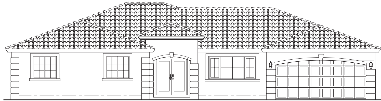
FRONT ELEVATION MODEL ACACIA