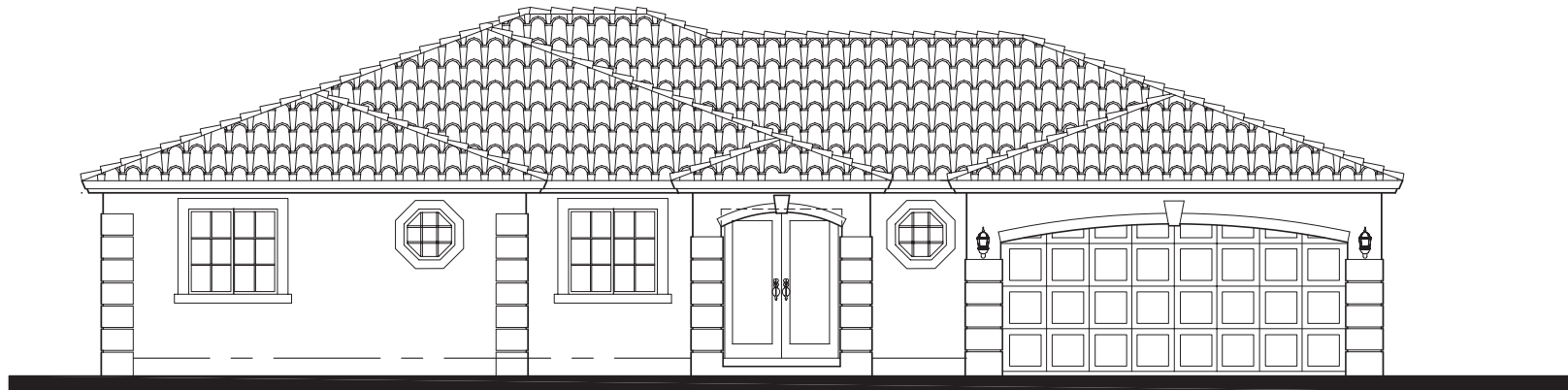
FRONT ELEVATION MODEL CYPRESS