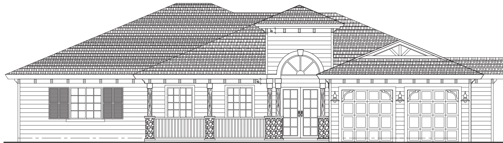
FRONT ELEVATION MODEL LAUREL SCALE: 1/4" = 1'-0"