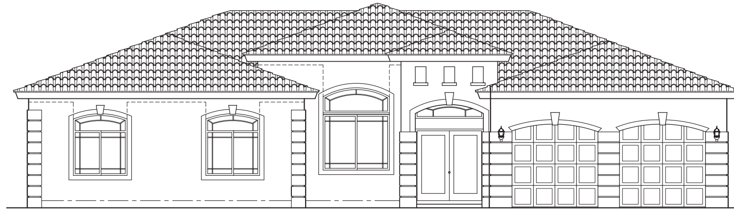
FRONT ELEVATION MODEL OAK SCALE: 1/4" = 1'-0"